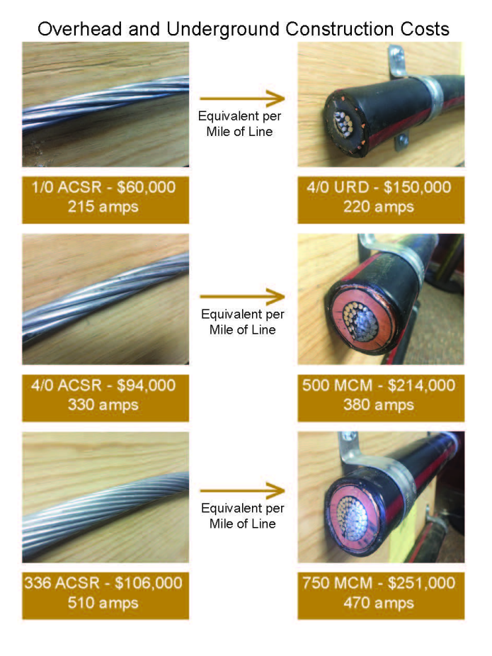
Visit our Website