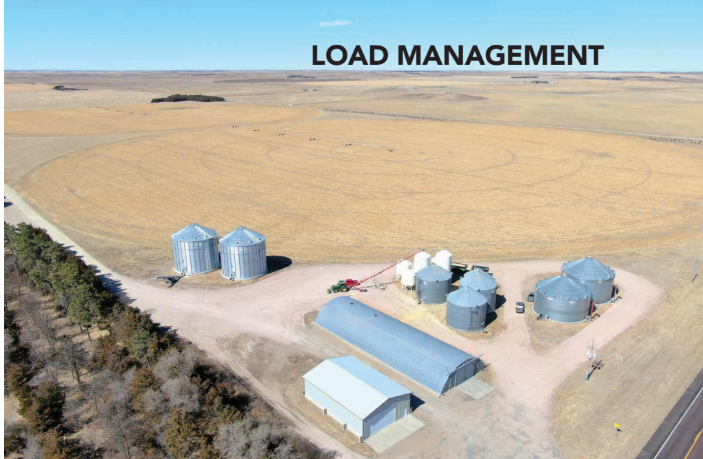
All of the roughly 200 irrigation pivots at Danielski Farms are under Cherry-Todd Electric’s load management program.

Another element that makes the program work for Danielski Farms is the installation of a remote irrigation control system. All of Danielski’s pivots