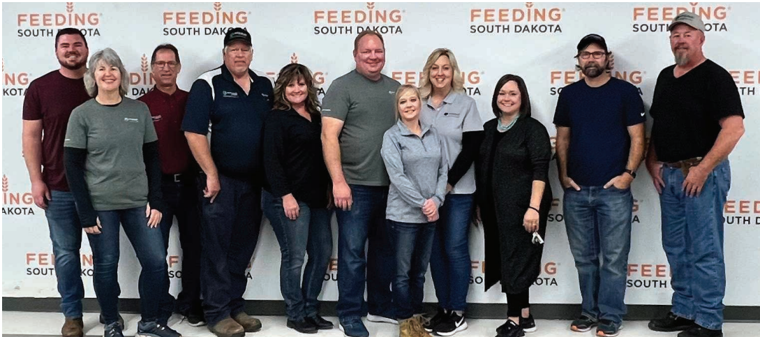
Left: In late November, a team from Sioux Valley Energy packed food boxes at the Feeding South Dakota facility in Sioux Falls. Opposite page: Co-op employees raked a lawn in Hills, Minnesota and (below left) volunteered with friends for Project Joy.