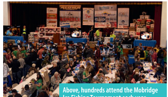
Above, hundreds attend the Mobridge Ice Fishing Tournament each year. Below, "ice castles" bring comfort and convenience to the sport.