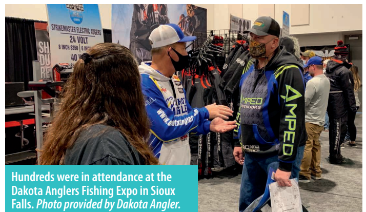
Hundreds were in attendance at the Dakota Anglers Fishing Expo in Sioux Falls.

Instead of a simple ice auger as a grand prize, today the tournament gives away roughly $225,000 in prizes, including Ice