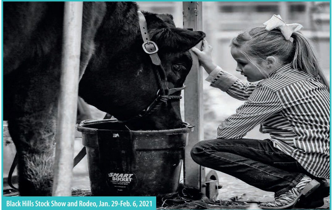
Black Hills Stock Show and Rodeo, Jan. 29-Feb. 6, 2021

Dakota Ridgetop Toy Show, Codington County Extension Complex, Watertown, SD 712-261-0316