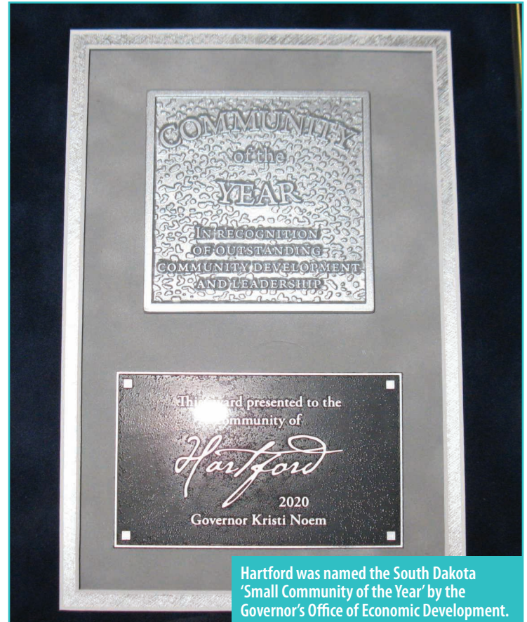
Hartford was named the South Dakota 'Small Community of the Year' by the Governor's Office of Economic Development.